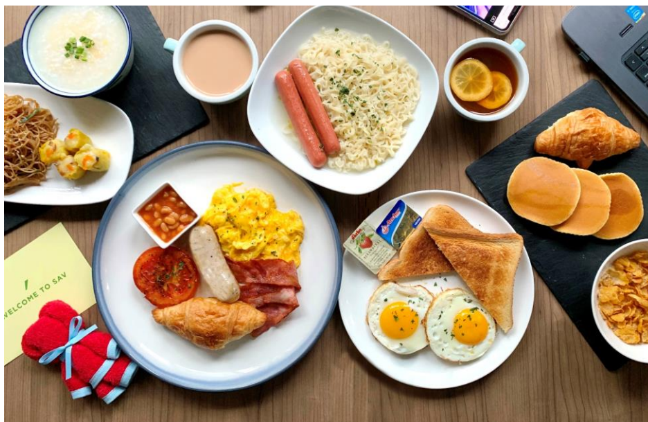
MOREISH & MALT Breakfast