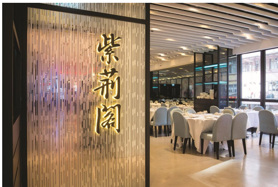
Bauhinia Kitchen Cantonese Cuisine