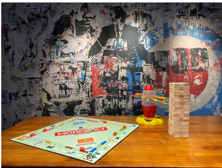
The Space@sáv – recreational facilities

逸•酒店 香港九龍紅磡蕪湖街83號 Hotel sáv 83 Wuhu Street, Hungghom, Kowloon, Hong Kong T +852 2275 8888 F +852 2275 8999 info@hotelsav.com www.hotelsav.com