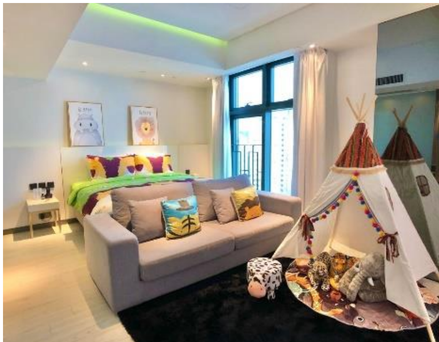
The sáv Special Collection – Family Themed Suite