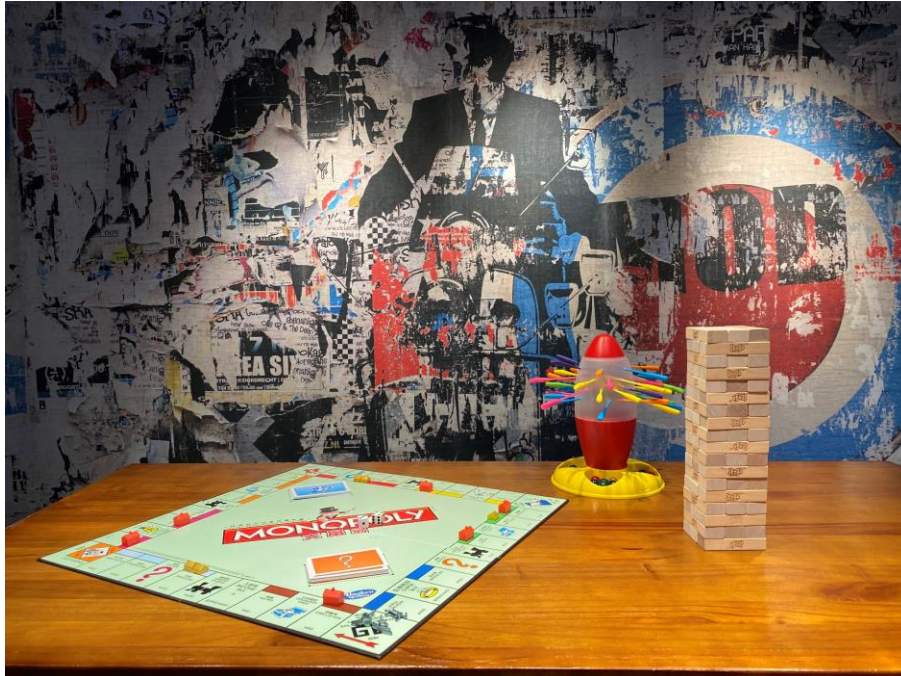
The Space@sáv – recreational facilities