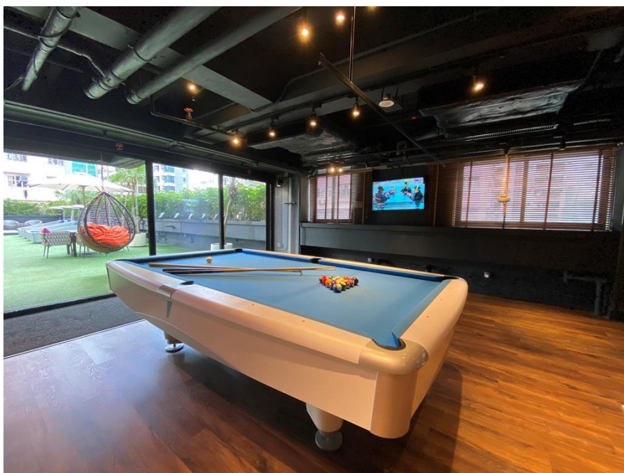
The Space@sáv – recreational facilities

逸•酒店 香港九龍紅磡蕪湖街83號 Hotel sáv 83 Wuhu Street, Hunghom, Kowloon, Hong Kong T +852 2275 8888 F +852 2275 8999 info@hotelsav.com www.hotelsav.com