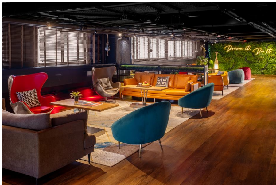
The Space@sáv – recreational facilities