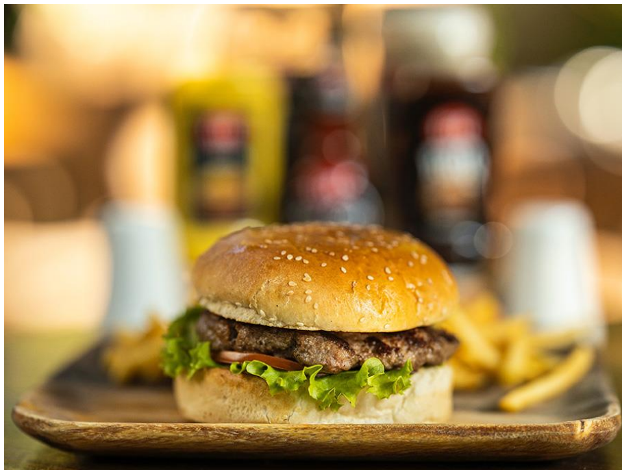
SSHKB1963 Burger meals