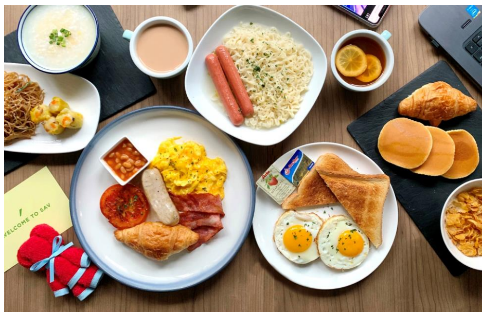
MOREISH & MALT Breakfast

逸•酒店 香港九龍紅磡蕪湖街83號 Hotel sáv 83 Wuhu Street, Hungghom, Kowloon, Hong Kong T +852 2275 8888 F +852 2275 8999 info@hotelsav.com www.hotelsav.com