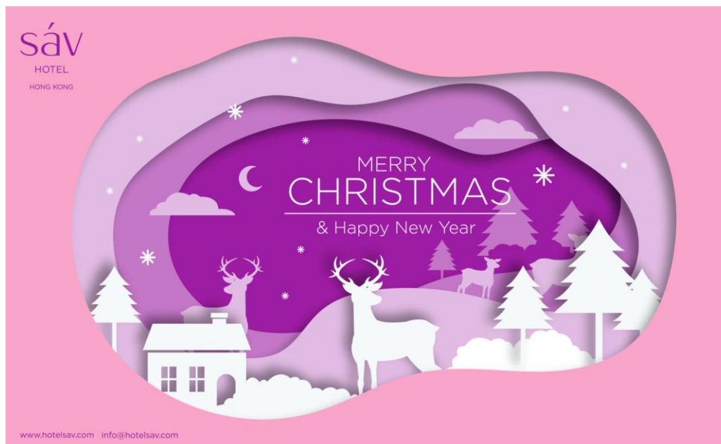
Hotel sáv Hong Kong Festive Staycation Room Package

逸•酒店 香港九龍紅磡蕪湖街83號 Hotel sáv 83 Wuhu Street, Hunghom, Kowloon, Hong Kong T +852 2275 8888 F +852 2275 8999 info@hotelsav.com www.hotelsav.com